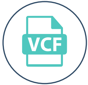
Raw Variant List